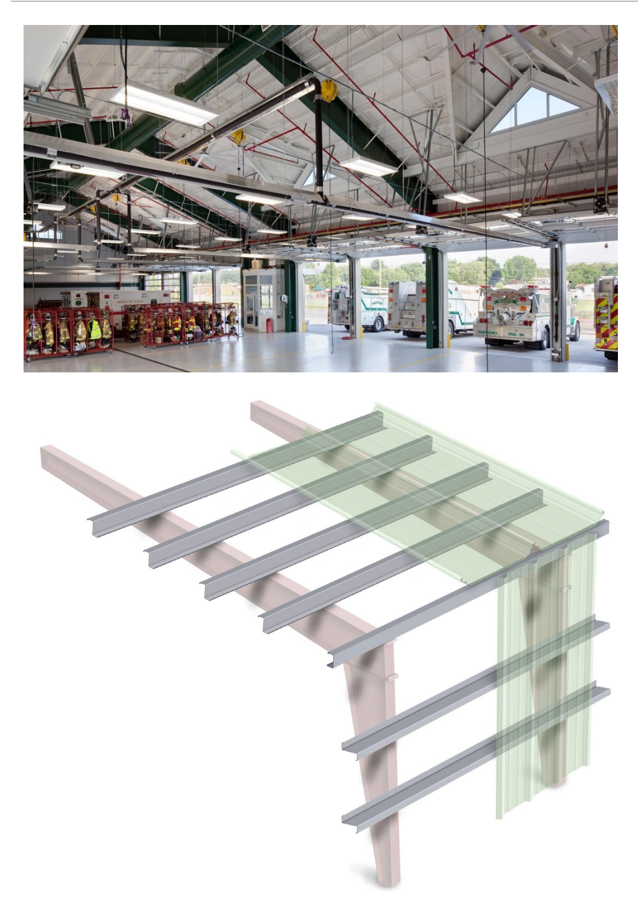
Illustration of secondary structural steel framing (girts/purlins) supporting the metal roof panel (standing seam or through fastened) and metal wall panel (through fastened) cladding. The girts and purlins are attached to the primary structural steel framing.

Metal Building Manufacturers Association Industry-Wide EPD