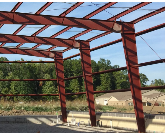
Girts and purlins attached to primary structural steel frames. Various types of bracing shown, such as xbracing, flange bracing, girt/purlin bracing.